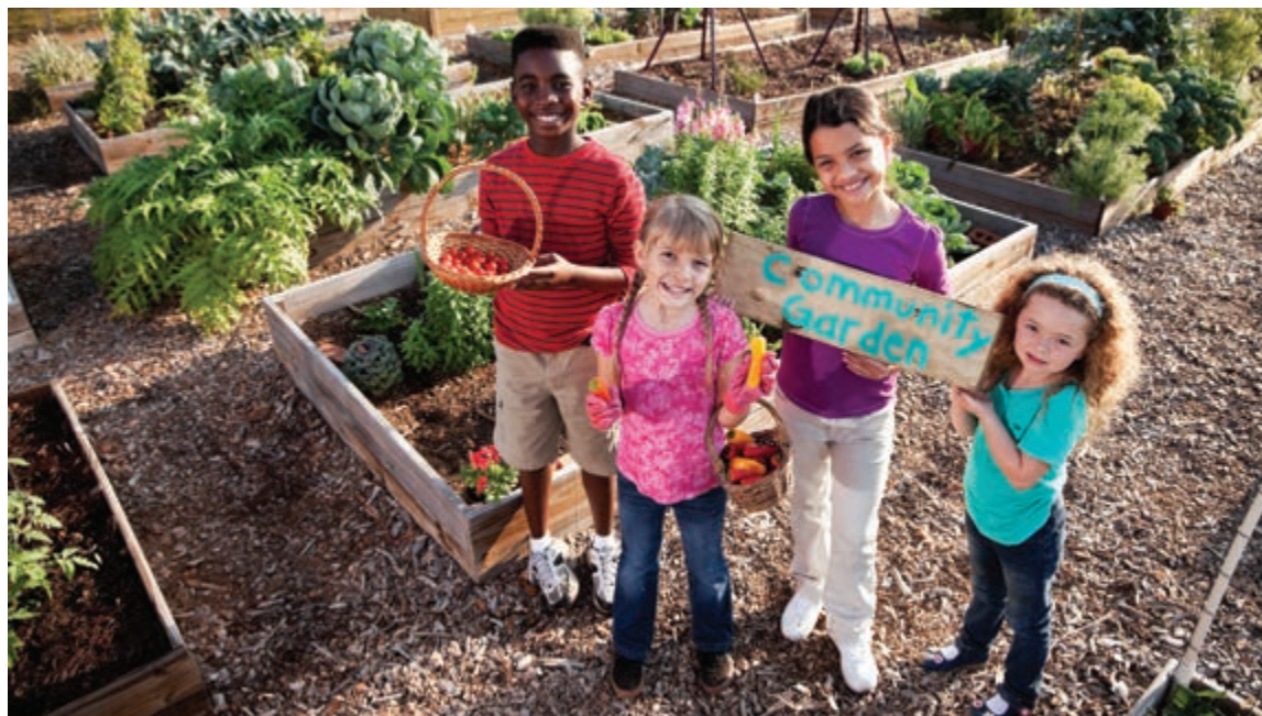
Community gardens can improve public health and provide food security in times of crisis.