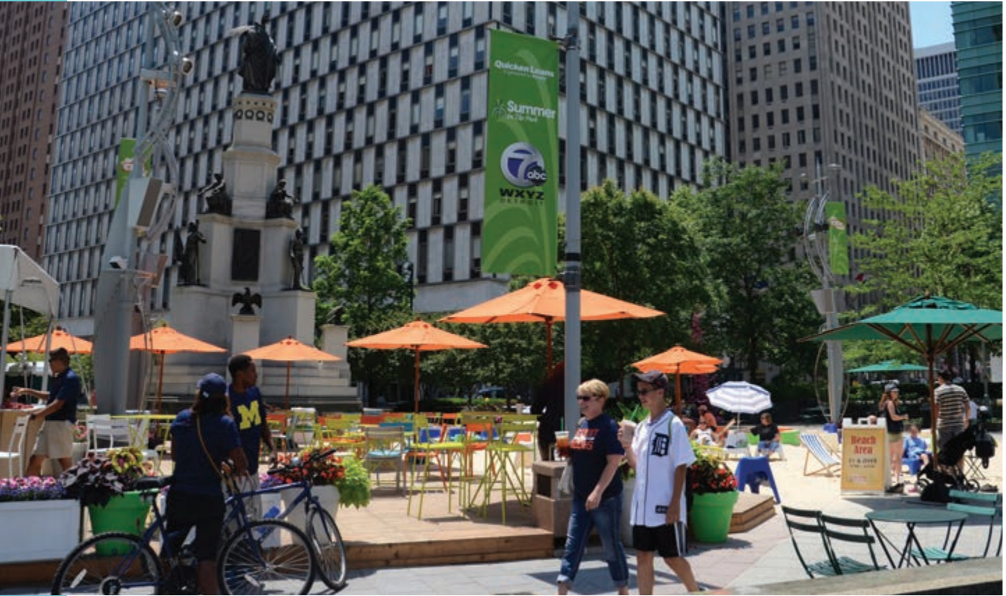
People enjoying the revitalized Campus Martius park in Detroit, MI.