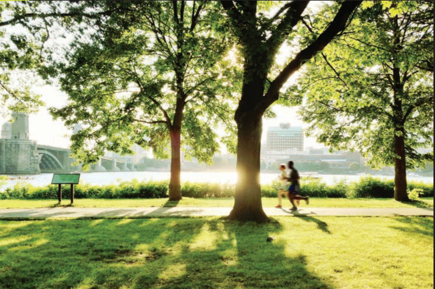
Runners in a Boston park.