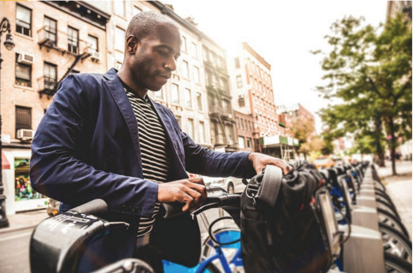
Bicycle commuter, New York City.

Resilience requires a holistic view: focusing myopically on the system at a single scale, or managing for a single outcome, is likely to yield surprises from unanticipated feedbacks. So, managing resilient cities begins with an understanding of urban systems and their functions at many scales, from many perspectives. But, given the extraordinary complexity of cities, it also calls for a certain amount of humility; an admission of what is unknown—and unknowable. 72