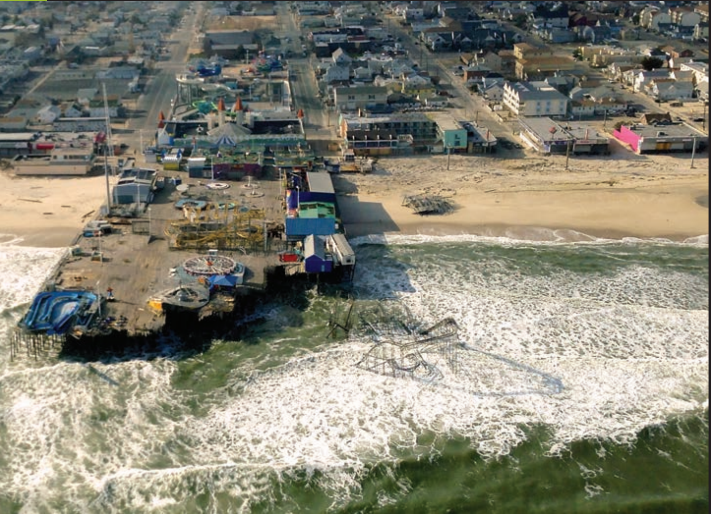
A pier destroyed by Superstorm Sandy.

In a world of rising inequality, risks and opportunities are not equally shared.