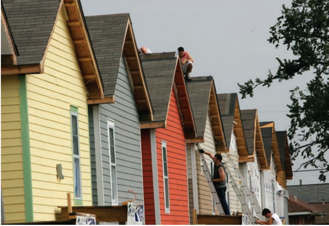
Volunteer construction workers with Habitat for Humanity build homes for displaced musicians in the Upper Ninth Ward of New Orleans, Louisiana.

Ecological resilience thinking is rooted in systems theory, which holds that nothing exists in isolation. While the prevailing Enlightenment worldview reduces systems to their component parts, systems thinkers endeavor to comprehend the integrated whole. 44 Resilience thinkers see ecosystems and human society as complex adaptive systems (CAS): they are complex in that they are diverse and composed of multiple, interconnected elements; they are adaptive in that they have the capacity to change and self-organize.