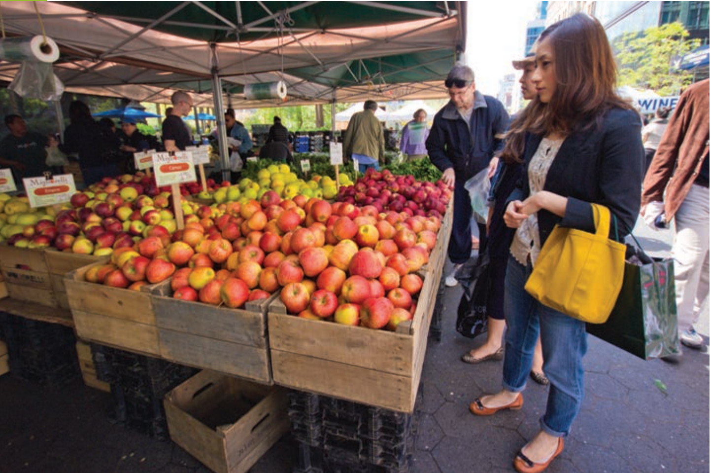
A woman shops for fresh produce at Union Square Greenmarket in New York City, where regional farmers, fishermen, and bakers sell their products.

Florida's Metropole project. With a better understanding of the risks they faced, the community elected to increase taxes in order to lift buildings above the flood zone. 34