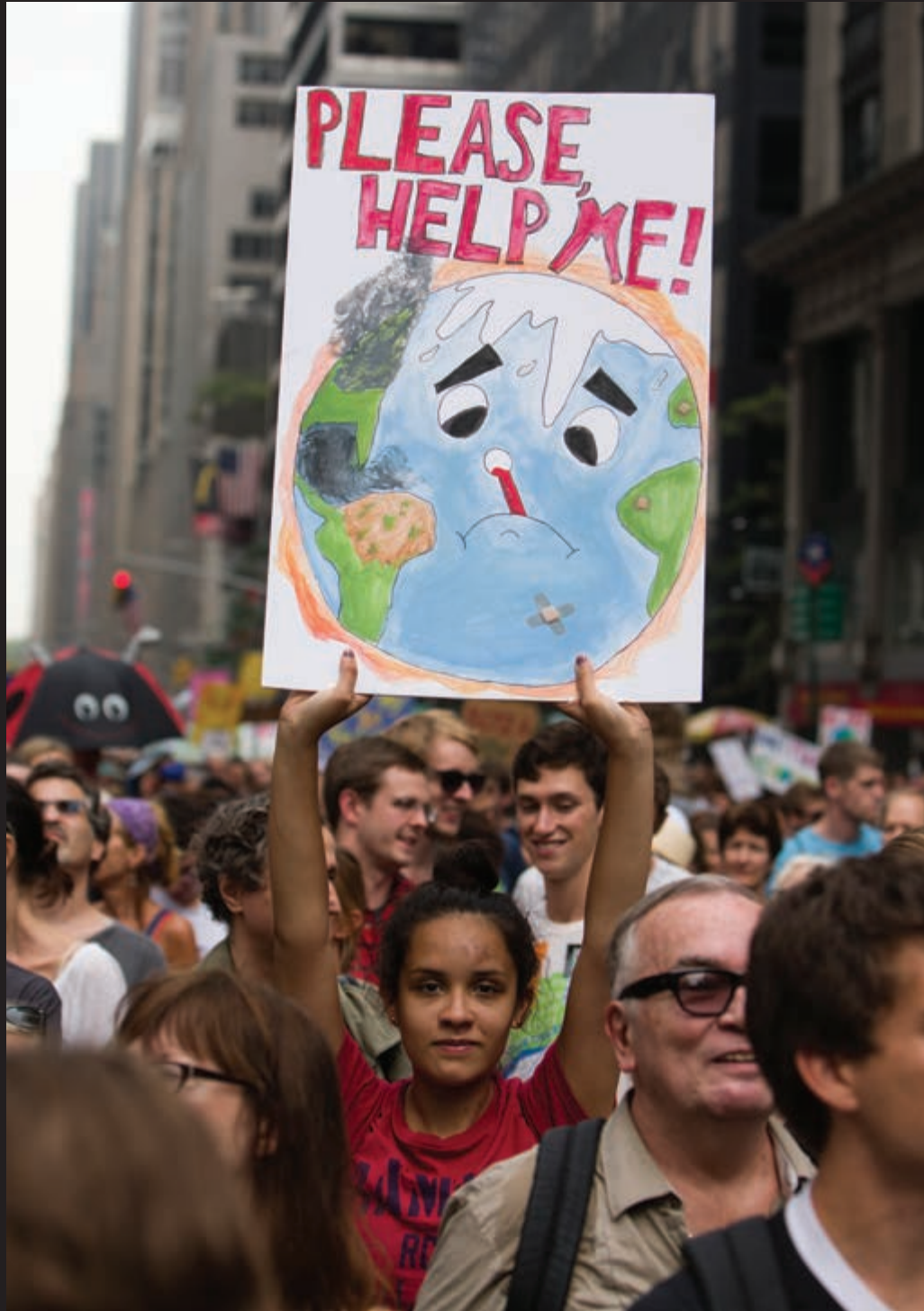
A young demonstrator at the People's Climate March, which drew more than 300,000 to New York City on September 21, 2014.