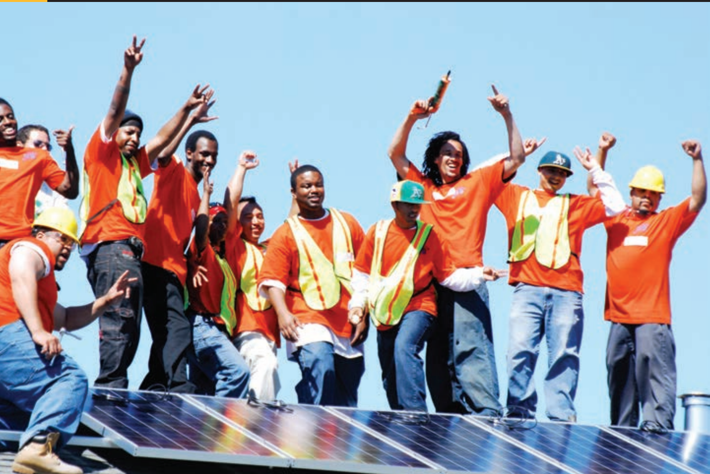
Job trainees get hands-on experience installing a solar electric system for a low-income homeowner in Richmond, CA.

We define urban resilience as the capacity of a community to anticipate, plan for, and mitigate the risks—and seize the opportunities—associated with environmental and social change.