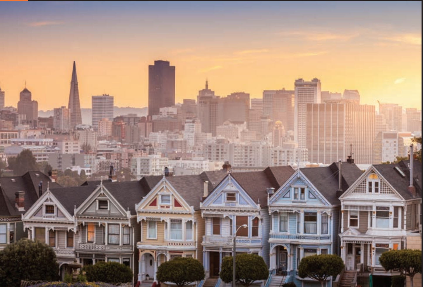
San Francisco at Alamo Square.

Cities are complex adaptive systems, and building urban resilience calls for a holistic, integrated approach.