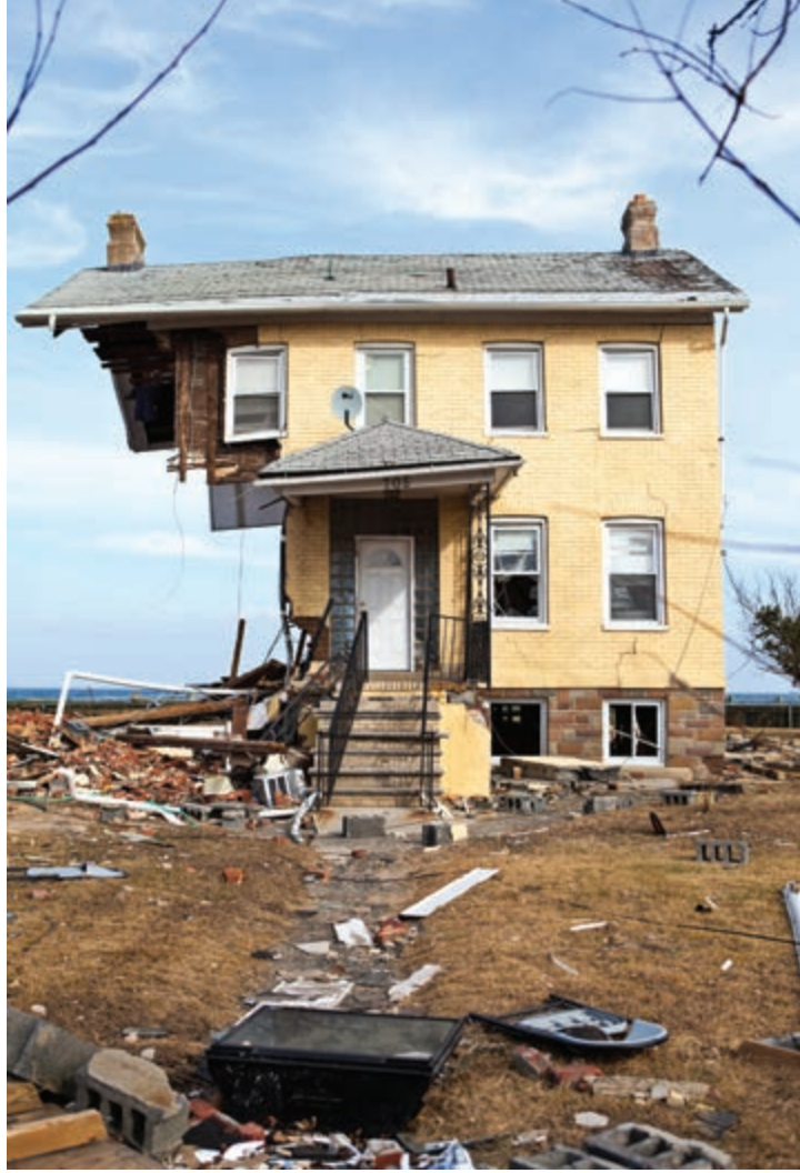
This waterfront home in Union Beach, NJ was destroyed by Superstorm Sandy.

At the same time, DRR—like other perspectives on resilience—has its limitations. For example, DRR practice has been criticized for paying insufficient attention to the underlying causes of vulnerability. 65 And as DRR is largely focused on discrete hazards, such as hurricanes or earthquakes, it may be less well-suited to the long-term changes wrought by climate change, or to problems that span multiple sectors—such as the 2011 tsunami/nuclear disaster that devastated Japan. 66